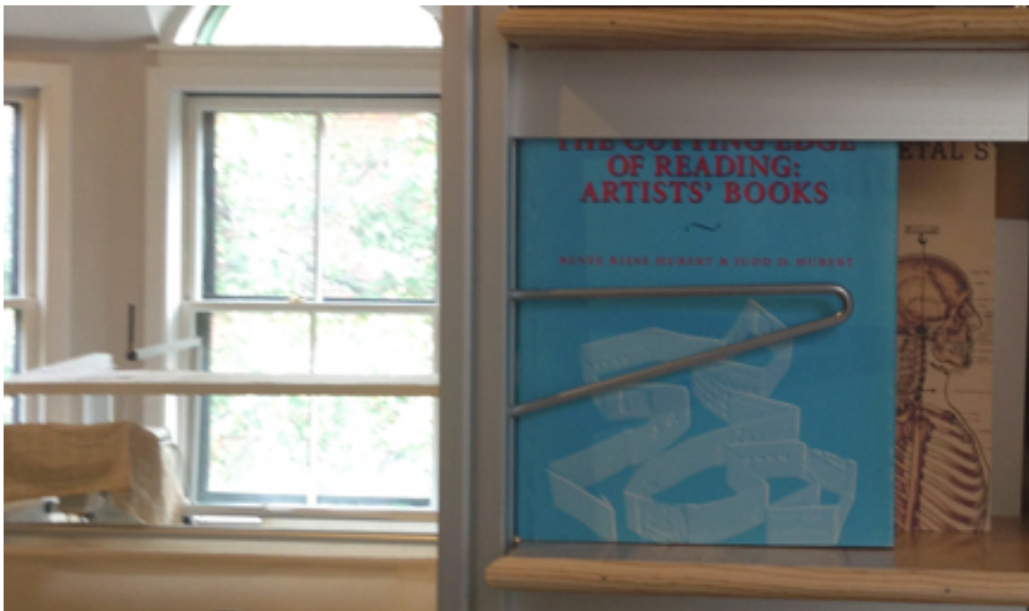
Rakks Style Bracket with Universal Wire Bookend