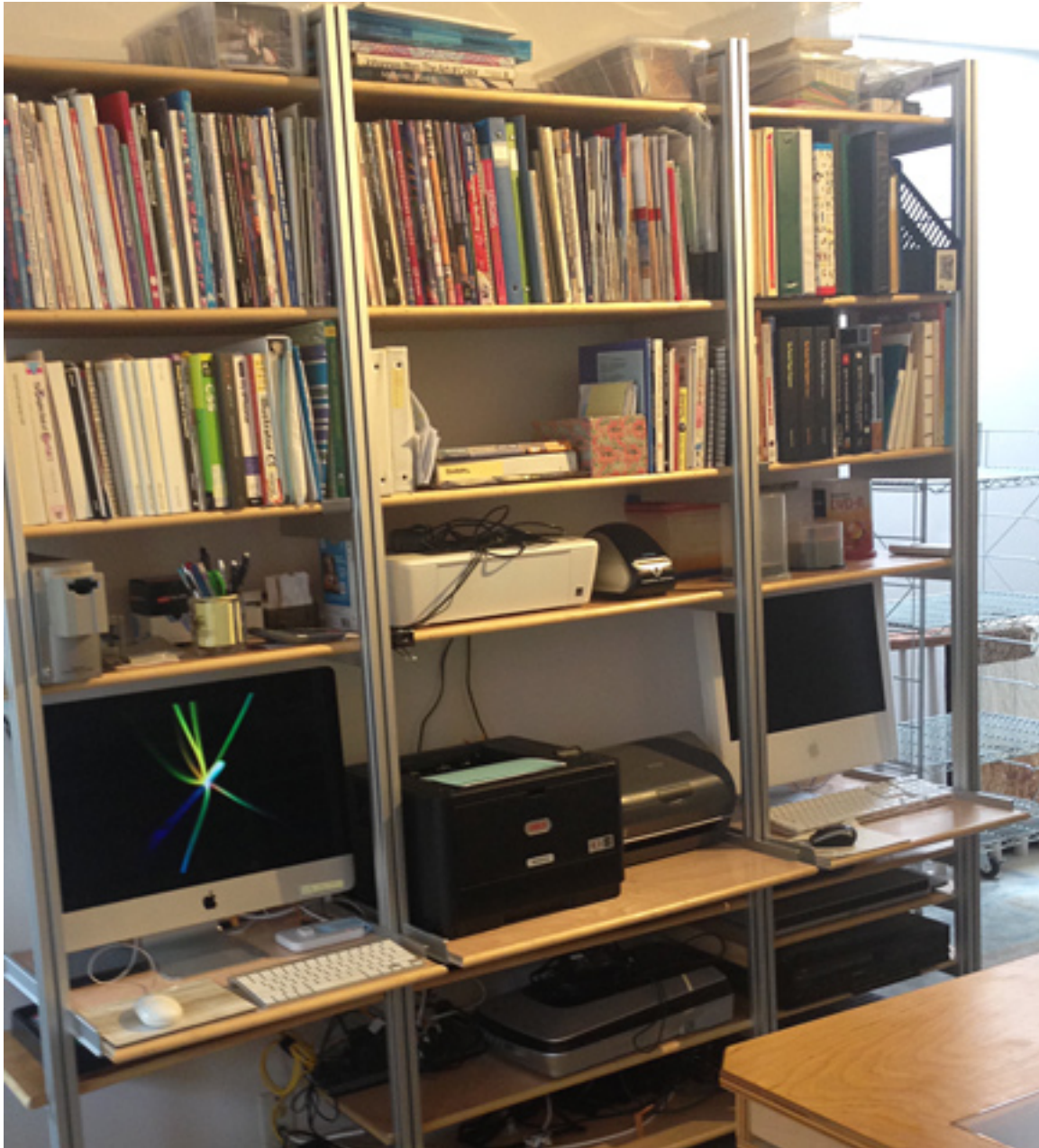
Finished Rakks system in Mary Gillis's studio

I began by having Boulter Plywood in Somerville, MA ( link ) cut four 14" deep plywood shelves for the top of the system. Next I installed Rakks vertical standards and the top mitered pieces. Once that was done, it was back to Boulter for the desktop and lower shelves. My walls are a little uneven, and I needed more stability for the top shelves, so I screwed a cleat into the wall under the back of the desktop shelves and secured them for stability.