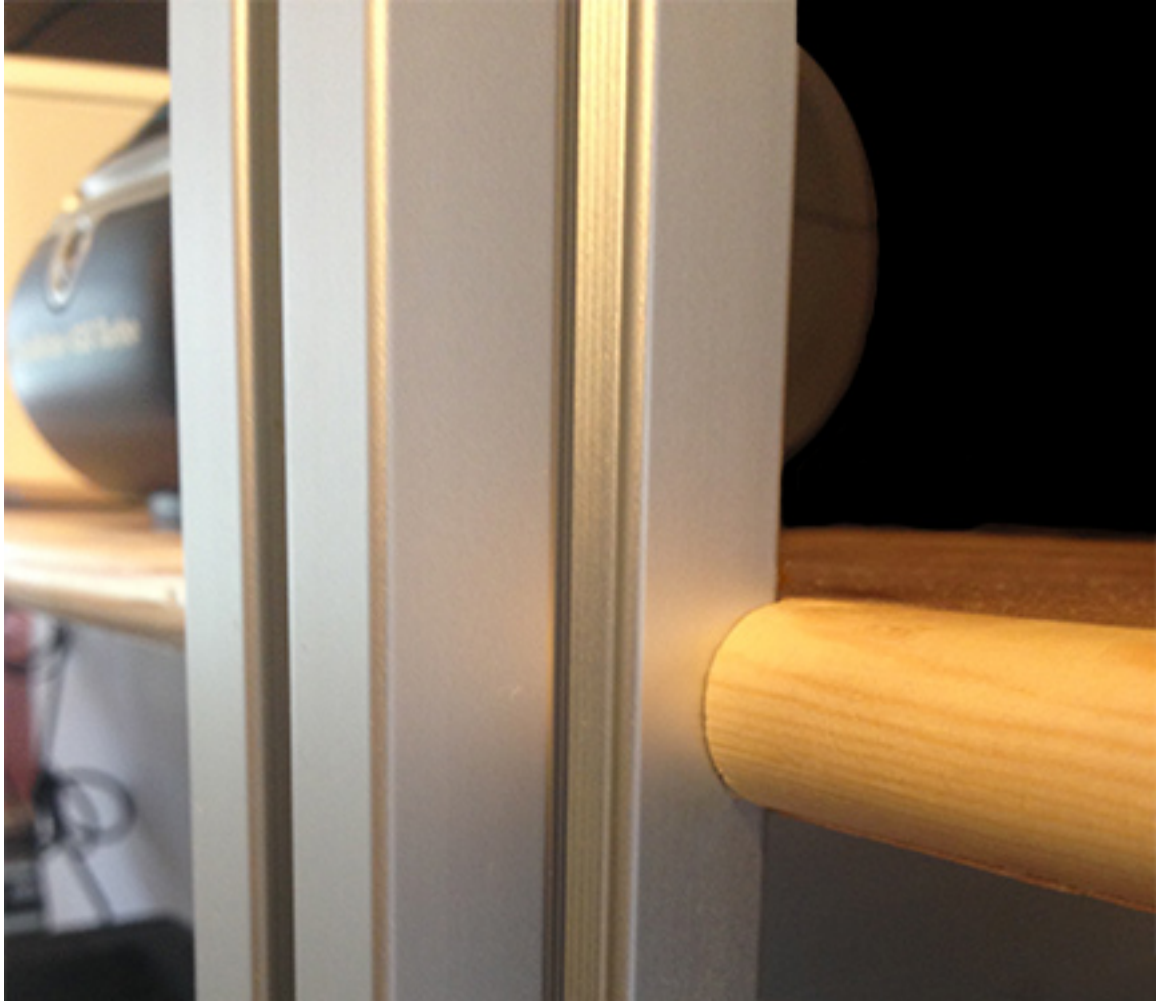
PC4 Pole with Mitered Tie Pole